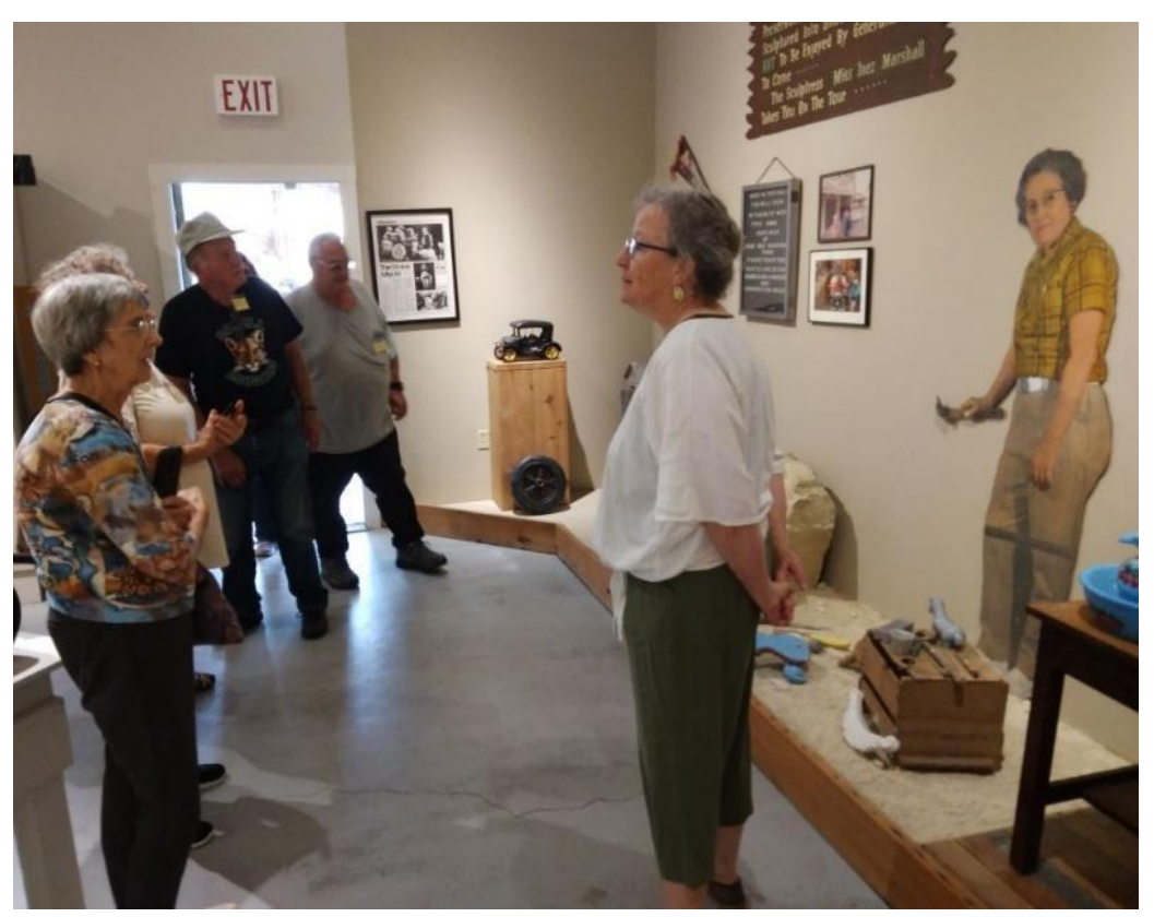
Pictures at Grassroots Art Center- Inside Exhibits and Outside Exhibits: